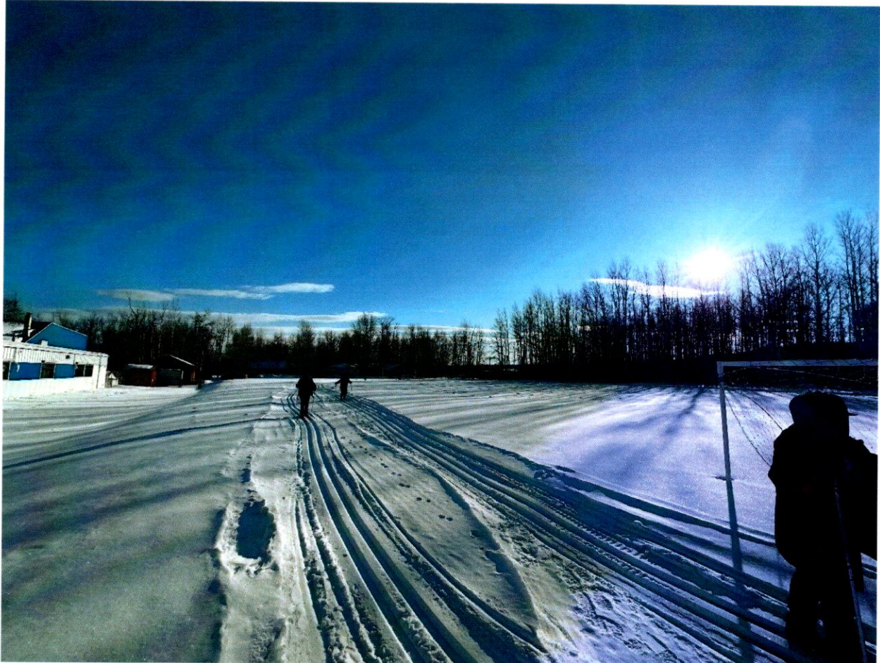
Cross Country Skiing with students at Echo Dene School.