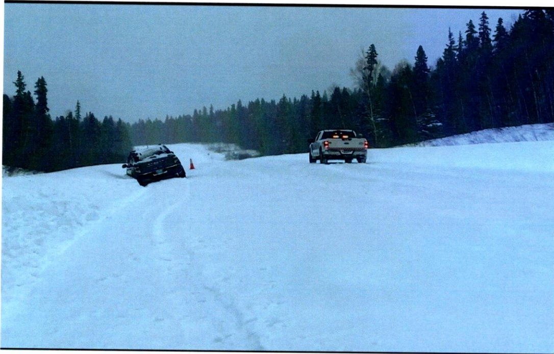
CSO's on scene of Fire Call, providing traffic/crowd control.